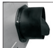
Hi-Impact Polystyrene Collar